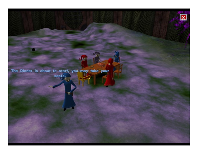
Figure 2: Dinner Ritual (Low Power Culture) - Characters rush to the table.

to the characters that the dinner will start and everyone should take their seats. Then the ritual proceeds with the characters seating at the table and starting to eat. However, while in the low power culture everyone rushes to the table immediately, not even waiting for the host to finish the announcement (see Figure 2), in the high power culture everyone has to wait first for the elder to sit before they can sit(see Figure 3), and then have to wait for the elder to start eating before they can eat. Moreover, the elder in the high power culture has the privilege to sit in the more fancy chair.