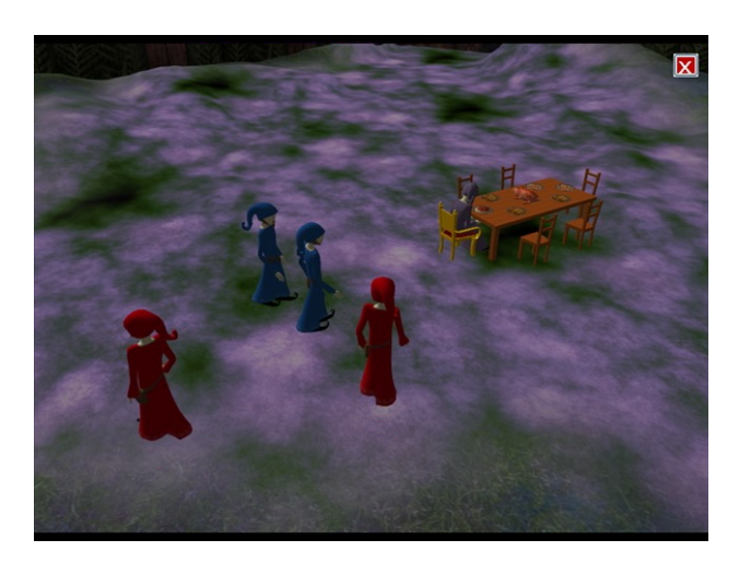
Figure 3: Dinner Ritual (High Power Culture) - Elder sits first in the fancy chair.

if so, if they understood those differences as being caused by the culture of the character, or by their personalities, or by neither one of these factors. Finally we asked users their gender, age, and nationality. We had 41 participants aged between 18 and 40 years old of which 73% were male.